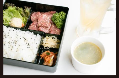
Wagyu loin set meal

"Coke" or "Ginger ale" or "Calpico" or "Calpico soda water" or "Orange juice" or "Orange soda water" or "Oolong tea" or "Green tea" or "Corn tea" or "Carbonated water"