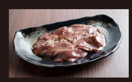
Domestic pork liver