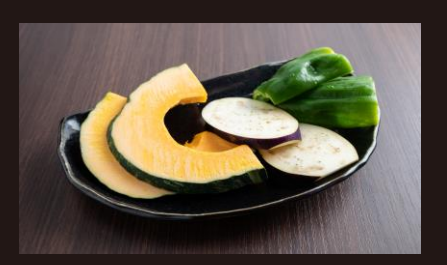
Assorted seasonal vegetables