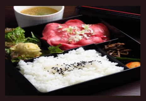
Beef tongue set meal

*Refill rice and refill soup cannot be ordered by anyone other than those ordering a set meal.