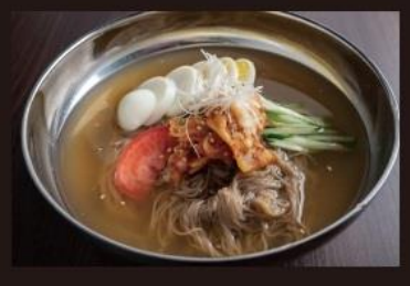
Korean chilled noodles