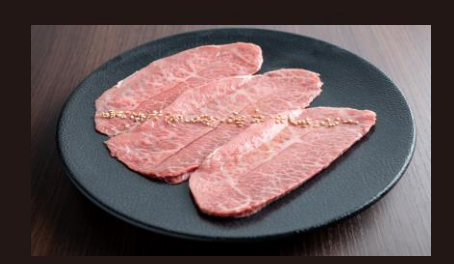
Top blade muscle