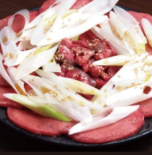
Beef tongue with salt and green onions platter