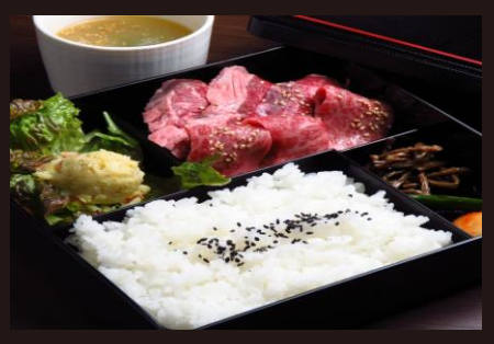
Wagyu boneless short rib and Outside skirt set meal